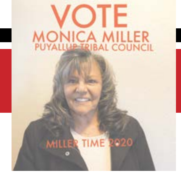
Hello Puyallup Tribal Members,

I am very Humble on the Support from all the Tribal Members with this Primary Election rather you Voted by absentee or in Person you all showed your involvement and voice with the Tribe. The New Election Drive up system that the Tribal Council approved due to the Coronavirus COVID-19 was a long wait with the drive up Voting Polls, but our Tribal Members waited the long hourly wait to make their Vote Count that is the most respected and caring Vote, my hands go up to everyone, I personally want to say thank you.