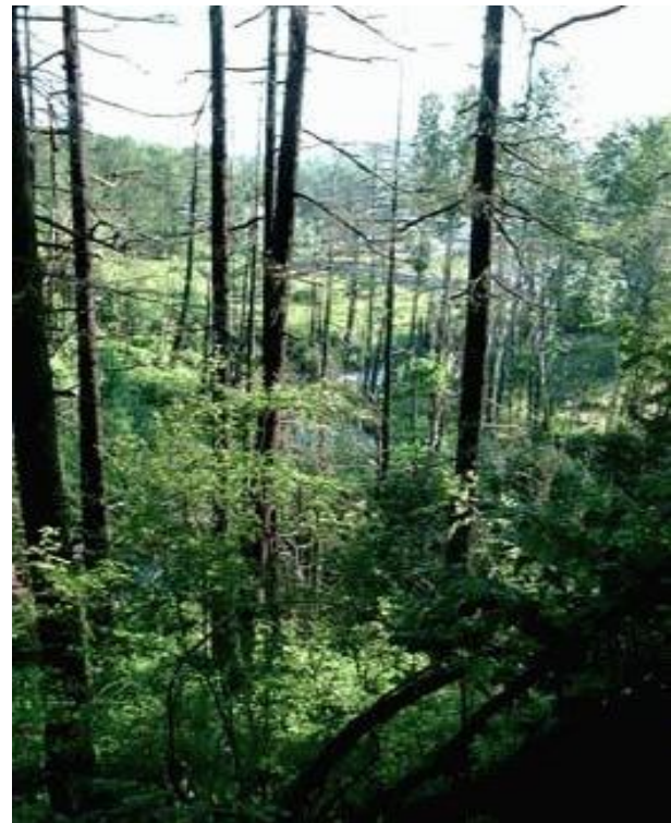
Figure 4.17-2 Whatcom Falls Park, 2003 16

A large petroleum pipeline rupture resulting in an explosion and fire will effectively destroy all vegetation and animal life in the burned area. Eventually this will begin to return to the pre-spill condition, although, depending on the scale of the damage, it might take years. Figure 4.17-2 shows the resurgence of vegetation in Bellingham's Whatcom Falls Park in 2003, four years after the spill and explosion that destroyed large portions of it. While the tall firs that were destroyed still stand the understory has already largely reclaimed the damaged property.