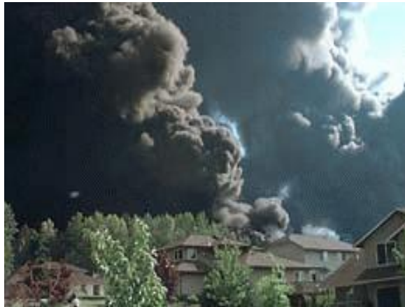
Figure 4.17-1 Olympic Pipe Line Rupture 06/10/99

06/10/99.) That incident could have been much worse if the gasoline had not ignited before entering much the downtown portions of Bellingham. Instead, by igniting when it did, most of the damage was confined to Whatcom Falls Park, a few residences and the water treatment plant located at the park.