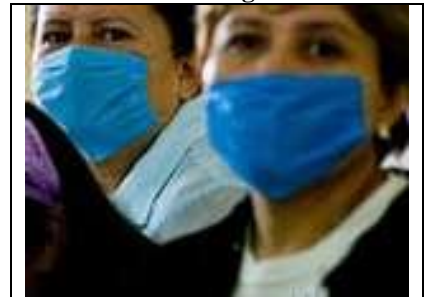
Figure 4.15-1 Individuals Hoping to Avoid Contacting Disease

Responders will be mostly from the medial services in fire departments, ambulance attendants and hospital personnel. Those diseases that are transmitted through human-to-human contact will put the rescuer in danger of coming down with the same disease.