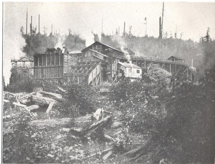
Figure 4.11-2 Lady Wellington Mine Tipple 4

Compounding the problem is that a number of the mines changed hands many times over the course of their existence and therefore changed names. In some areas, even the name of the now defunct towns changed as different companies moved in or out of an area. This can be seen in the area two miles northeast of Wilkeson, originally called Pittsburg. Named to emulate the coal and steel center of Pennsylvania, the name only lasted for twenty years from 1889 to 1909. In 1909 the name was changed to Spiketon and then to Morrystown in 1917 by the Washington State Legislature.