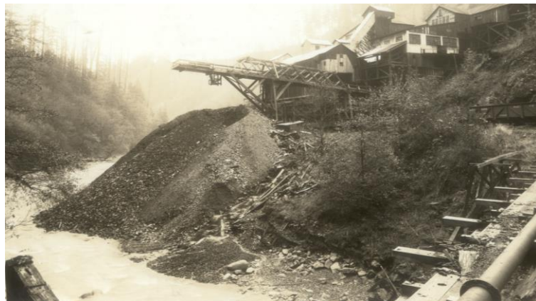
Figure 4.11-3 Pacific Coast Coal Mine Tipple, Carbonado 11

Response personnel entering an abandoned mine are at threat of injury and possibly death in the same manner of those whom they are attempting to find or rescue. These can include falling into unmarked shafts including old abandoned air shafts on the surface, collapse of the ceiling or part of the support structure, or asphyxiation from gasses that have