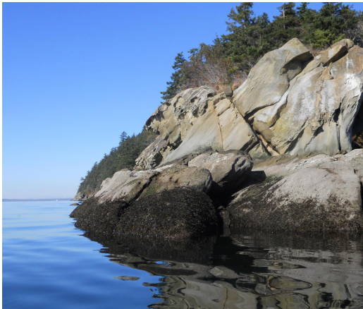
THE SALISH SEA