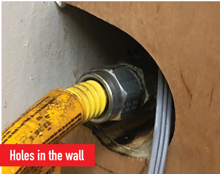
Holes in the wall